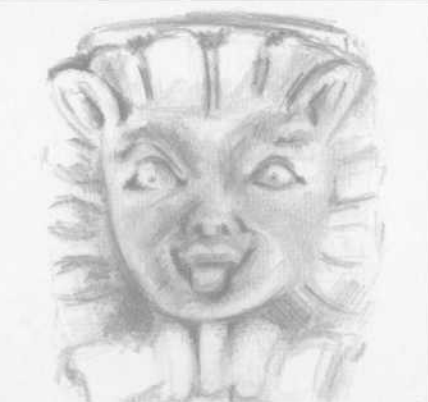
23, 24, 25, St. Barbara Bastion, Valletta.