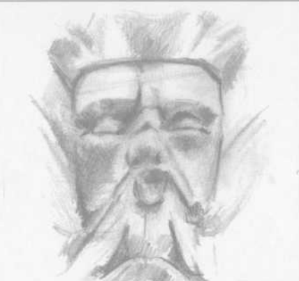
25, St. Barbara Bastion, Valletta.